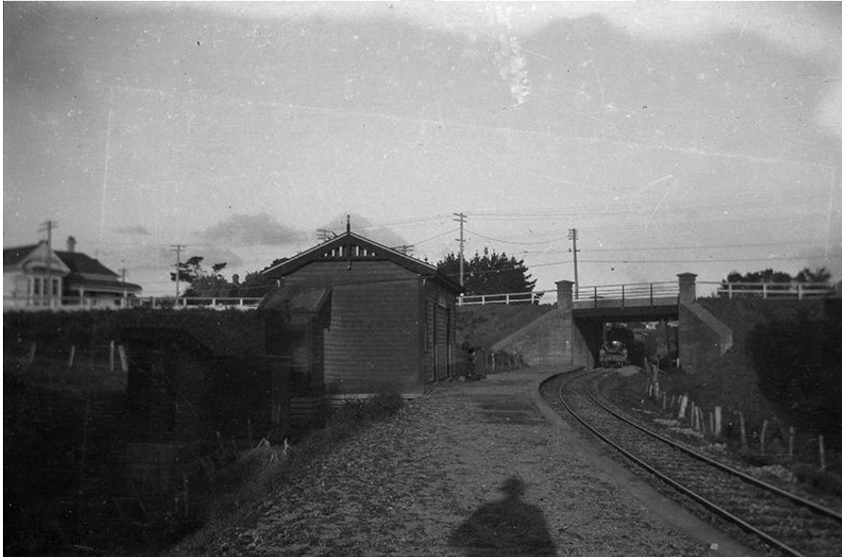
Fitzroy Railway Station, Strandon, circa 1930s, [Devon Street East overbridge with train emerging in background]

The railway deviation bridges continue to serve New Plymouth well into the twenty-first century and excepting the replacement of the original steel handrails, have been little altered since first constructed. Whilst rail traffic below the bridges has decreased significantly since 1907, vehicle traffic above has grown massively, with the Devon Street East bridge, the busiest of the four, now carrying an average of 19,000 cars every day!