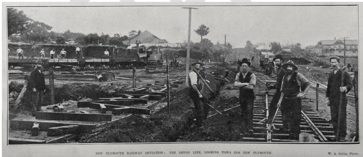
Devon Street East looking west towards New Plymouth from about present site of The Federal Store café. These railway tracks were temporary arrangements to facilitate construction.

Despite authorisation being given for construction of the railway deviation, the proposed route remained unclear; at least publicly. The general view expressed within local papers, by New Plymouth politicians, and the Borough Council, was that the railway should follow the sea route, with the town still pressing the government for this route until at least as late as early-June 1906. 15 However, the Railways Department had other ideas and were quietly proceeding with its own plan to deviate the railway along the present alignment between Molesworth and Buller Streets. It seems the Railways Department deliberately avoided consultation on the proposed route, ignoring requests from the Borough Council for information on the proposed route until long after the final decision had been made.